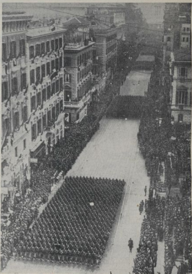
SPECTACULAR SCENE IN ROME—Expansive of the Italian militia marching along the Via Veneto, Rome, during the sixtieth anniversary of the founding of the nation.