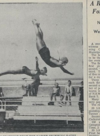
AN APPROOF FROM THE NAPIER SWIMMING BATHS.