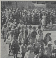
LESSONS FORGOTTEN—Napier West schoolchildren off for their second games.