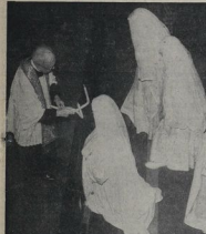
THE PRAY OF ST. BLAISE—The scene in St. Blaise's Church, Ely Place, London, during the ceremony commemorating the Feast of St. Blaise, an early Christian martyr.