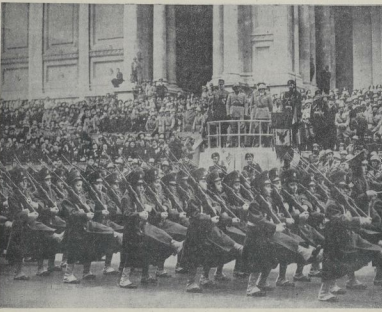
ITALIAN OFFICERS OF THE SPANISH WAR—The small team of Italian soldiers who have fallen in Rome searching before Regio Marina. The parade was a feature of the nation's anniversary of the founding of the Italian nation.