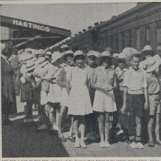
OFF FOR A DAY IN THE SUN—Children of the Hastings West School at the railway station before leaving for their annual picnic.