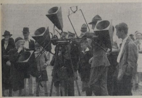
THE "EARS" OF THE ARMY —With their usual location the militiamen's ears can detect the approach of planes, and indicate their position, long before they are visible.