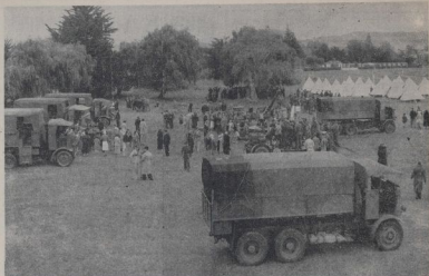
FIELD BATTERY IN CAMP —Great public interest has been shown in the activities of the 11th Field Territorial Battery at present in camp on the Napier Park extension at Greymouth. The camp will break up next Saturday, but during the week displays of military drill, machine work and other activities will reveal to the public something of the work done by New Zealand Territorials.