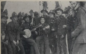
WITH HIS BANG ON HIS KNEE —Members of the 11th Field Territorial Field Battery enjoy a good moment.