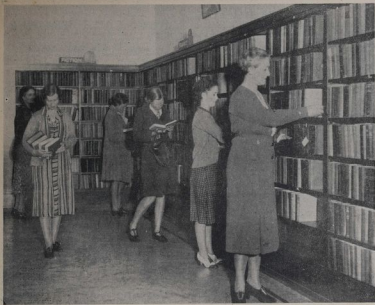
BOOK LOCKS —By their silent expressions these readers in the Hastings Public Library reveal the seriousness of the task of choosing "something to read." The small silver shelves give them plenty of scope.