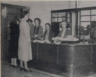
AT YOUR SERVICE —A compact library staff and an efficient filing system make for the popularity of the Hastings Public Library.