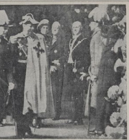
TWO MONARCHS IN LONDON—King George of Romania and King George VI of England at Victoria Station during King George's recent State visit. It is reported by cable that King Carol has expressed a desire to visit New Zealand with the Queen's Majesty and the Queen.

By Telegraph-Press Association. TIMARU, March 20. A speaker has warned that the current stock of a certain commodity is only enough for one week's supply.