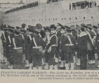
FRANCE LEAVES WARREN... The above is a reproduction of a photograph...