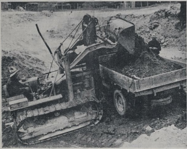
SHIPYARD'S NEW REBUILDING—Machinery and men are busy engaged in reconstructing the site for the new repair on Bluff Hill, Napier. The mast is being accepted in the support of Port divers, and also a portion of a large American steamer.

GRIM WARNING FROM REICH TO POLAND: DIPLOMATIC MOVES "OPPOSITION TO GERMAN WISHES MAY BE DANGEROUS" TROOPS MOVE ALONG FRONTIER DANZIG FEARS: "TENSION CAUSED BY VERSAILLES"