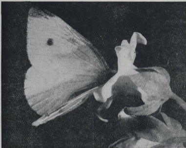
DEATH OF A DESTROYER.—A white butterfly, attracted by the flower of the well-known "mush plant," falls victim to a deadly trap. One of its legs is stuck in the sticky liquid, the butterfly soon dies.