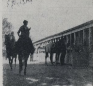
EARLY MORNING SCENE AT THE RACETRACK.—The stabling, unloading, and milking done at hours make the morning busy at Hastings.