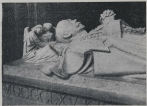
RESTING PLACE OF GEORGE V.—The permanent tomb of King George V at Windsor, showing a close-up of the head of the deceased figure, which was carved in white marble by Sir William Reid Dick, R. A.