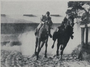
AND NOW FOR THE RUN HOME.—Candidates for events at the Hawke's Bay Jockey Club's autumn meeting have a view of their build as they round the home turn in the gush and stretch out for the win home during their training session.