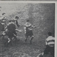
WELL CLEARER—The Dannevirke Old Boys team, Dannevirke, N.Z., who play in a good league.

Waipawa (Black and Gold) defeated Waioara (Black and Gold) 28 to 6. Waipawa (Black and Gold) defeated Waioara (Black and Gold) 28 to 6. Waipawa (Black and Gold) defeated Waioara (Black and Gold) 28 to 6.