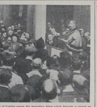
THE "BIG PAUL"—The Lord Mayor of London goes the morning dress which brought a second row of applause in the City.

The Minister of Finance today commented on the preliminary report of the Public Accounts Committee. The Minister of Finance today commented on the preliminary report of the Public Accounts Committee. The Minister of Finance today commented on the preliminary report of the Public Accounts Committee.