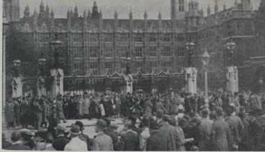
THE INTERNATIONAL SITUATION —A huge crowd gathers outside the Houses of Parliament in London, awaiting the results of the special meeting of Parliament which was reviewed last month by considerable international delegates following the results of the Albatraz.