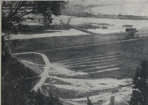
RECLAMATION WORK AT PORT ANHURST —Spill from the cliffs near the Iron Pit is being used to fill in the lagoons in the old Inner Harbour. This will add greatly to the space available for industrial expansion at the Port.