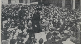
RECRUITING DRIVE IN LONDON —A record response was made to the recent recruiting drive in Britain, and volunteers are growing in number daily. Such efforts will see some 60,000 Women's Auxiliaries, London, maintained by a unit crew.