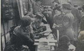
WOMEN RECRUITS —A woman volunteer makes enquiries at the stall of the London Women's Auxiliary Voluntary Service during the recruiting drive last month.