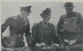
THE KING AT ALBATRAZ —Their Majesty the King and Queen visited Albatraz on April 12 to witness special service ceremonies, where, was captured was demonstrated.