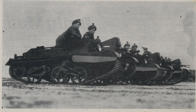
TERRITORIALS IN TRAINING —The London Irish Rifles of their Easter training camp in Porthglen, Barry. The Whippet tanks are manœuvred with them.