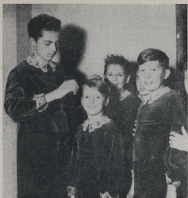
LITTLE TITILLATION —Promising actresses backstage while the Yvonne girls were "brushed up" for their parts.