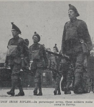
LONDON IRON RIFLES—In postwar years, these rifles make a good showing at the Bazaar on in Barry.