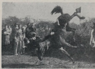
EXTRAORDINARY SPILL —W. D. Paddy on "Dundee" comes to grief during the Easter race at the Whippet Valley (Times) / Photo by ...