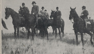
"EAGER TO GO"—A happy assemblage to the barbers' during the Block's May Day meeting takes while the voters waited for the results to be given.

Mr. Bruce is expected to discuss the economic situation with the American Government. It is stated that the British Government is not prepared to discuss the details of a general war, especially in France.