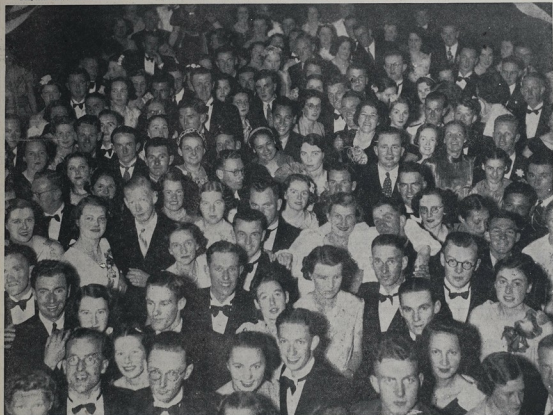
WEDDING BALL —A group of happy dancers at the St. Joseph Tennis Club's Regatta Ball held in the Assembly Hall, Hastings, on Wednesday evening.