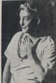
"I AM BEYOND" —Miss Price, comedian, in an irresistible burlesque in Stanley McEay's "Gossamer of 1939."

New easy method gets washing done in half time— GIVES BRILLIANT WHITENESS!