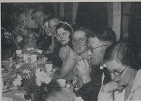
A WEDDING INTERLUDE —At the supper table, Dr. Joseph's Tennis Club's Regatta Ball at Phillip's, on Wednesday evening.