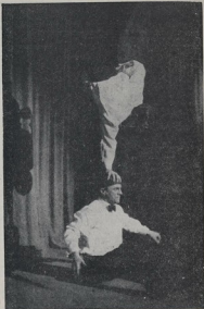
PERFECT BALANCE —The performer in a 40-pound coat in Percy McEay's "Gossamer" Municipal Theatre, Hastings, last night.