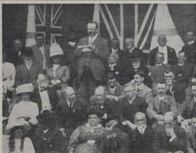
British Officers Visiting (Received May 4, 4.30 p.m.) Officers of the British Expeditionary Force are visiting the Japanese Embassy in London...