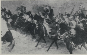
ITALIAN AUXILIARIES —Native troops in Tripoli stage a war charge for the benefit of Field Marshal Gouraud, the German Air Minister, who visited Tripoli on April 20.