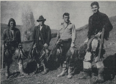
BAD WEATHER FOR DOCKS —Despite the unforseeable conditions—clear sky and absolute calm—this foursome got a good bag between Fossil and Dredgins on the morning of the aborted scene.