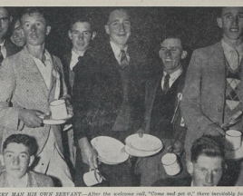
EVERY MAN HIS OWN SERVANT.—Above the welcome old, "Come and get it" there is something to be seen. They are all, look up, look up.