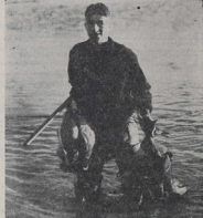
BACK WITH THE SPONGE. —A successful Hawke's Bay Amateur glider has homeward way with a heavy load.

Really this tea is good - excellent, in fact. I must remember the name ... LIPTON'S