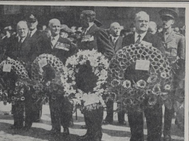
ASAP DAY IN LONDON - Post-World War I and other representatives with their wives at the Empire in London.

AWARD MADE TO WANGANUI OFFICIAL RECEIVED