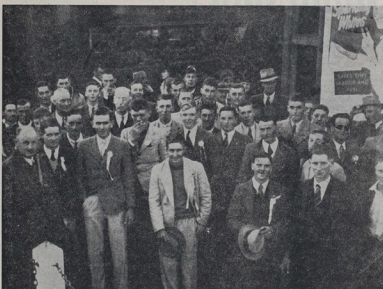
THE REAL BACKBONE OF FUTURE N.Z. —All ready for their educative work, the young farmers await of Hastings railway station. Snapped on Monday.