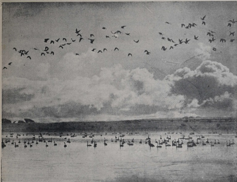
A COMPOSITE PICTURE. —One photograph is here superimposed on another to show at the same time black swans in the Ahuriri Lagoon and terns in flight. A typical autumn scene.