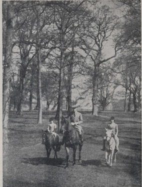
RURAL PEACE AND SOCIETY. —The Princess Elizabeth returned her Hibernian birthday her Royal father took her children for a special treat in scenic English surroundings.