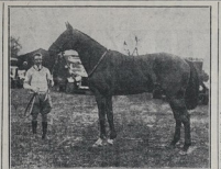
LANGDON who has been standing at "The Curragh" stud for the past two seasons at Stratford. The stud is likely to re-transfer to the Bannigan district in the near future.

C.P. Line UNION STEAM SHIP CO. OF NEW ZEALAND LTD. REGULAR SERVICES