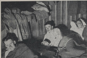
"AND SO TO BE"—After a strenuous day's work in pursuit of new ideas, the young prince are glad to "hit the hay" at the Hastings residence.