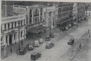
GLASGOW'S BUSINESS AREA.—A view of Glasgow Road looking towards the river, with the residential district of East in the background.