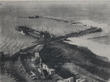
THE PAPER BREAKERS—General view of the new development was made at the local's working yesterday. This power also at the breaker No. 2. A short run from the Hill.

LEADING ARTICLES... NATIONAL NEWS... LOCAL NEWS... SPORTS... CLASSIFIED ADVERTISEMENTS