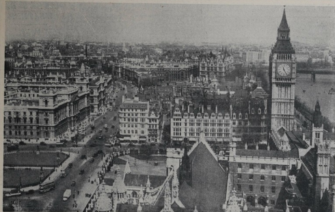
THE HEART OF THE EMPIRE.—London was locked in glorious sunshine as this panoramic photograph was taken from the top of the House of Lords looking towards Big Ben.