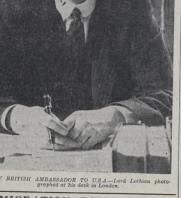
NEW BRITISH AMBASSADOR TO U.S.A.—Lord Lushington