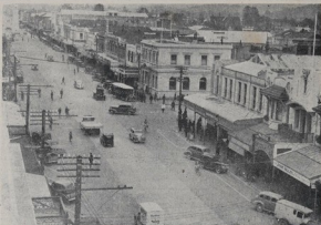
GLASGOW'S BUSY CORNER.—The intersection of Glasgow Road and Port Street. The clock tower may be seen at the end of the street at top left.