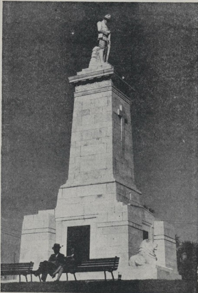
PERPETUAL HOME TO THE DEAD.—The beautiful new memorial at Glasgow stands on the East side of the Forthglen River near the East bridge.