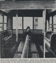
BUS FOR SCHOOL CHILDREN —Built by a Wiggins contractor in the name of the Hawke's Bay Education Board, this bus will carry children from Teanau, Papanui and De Ruvo to Oram, and continue to carry pupils to the Hastings District High School. The vehicle provides comfortable seating accommodation for 32 children.