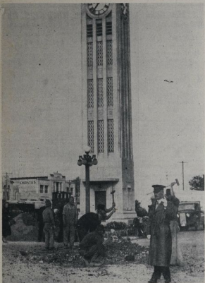
FRENCH DRESSING IN HARD COUNTRY —Dishwashing operations in Hastings necessitated the closing up of Hastings Street at the railway crossing. This hard task was accomplished speedily.