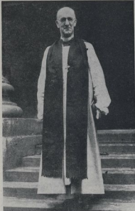
NEXT BISHOP OF LONDON —Dr. Geoffrey Francis Fisher, Bishop of Hereford, whose appointment as Bishop of London in succession to Dr. A. F. Woodhouse began last week announced.