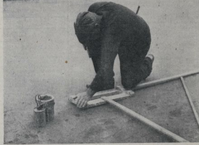
MACHINERY, BE CONSIDERATE! —An appeal has been made for drivers to give consideration to workmen engaged putting ground level on the streets in preparation for the Borough Council's new traffic control scheme to come into operation next month.