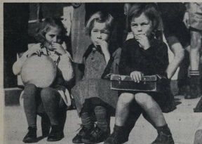
SNACKS IN —But there is always time for a snack in the playground. These children are interested from their heads to their toes—especially eyes.