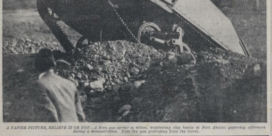
A NAZIS PICTURE, BELIEVE IT OR NOT—A Jew you notice in white, repeating eye looks of Post Aachen yesterday afternoon during a demonstration. Seen the jaw protruding from the corner.

LEADING ARTICLES PAGE 2. NATIONAL NEWS PAGE 3. LOCAL NEWS PAGE 4. SPORTS PAGE 5. THEATRE PAGE 6. LETTERS PAGE 7. CORRESPONDENCE PAGE 8. ADVERTISEMENTS PAGE 9.