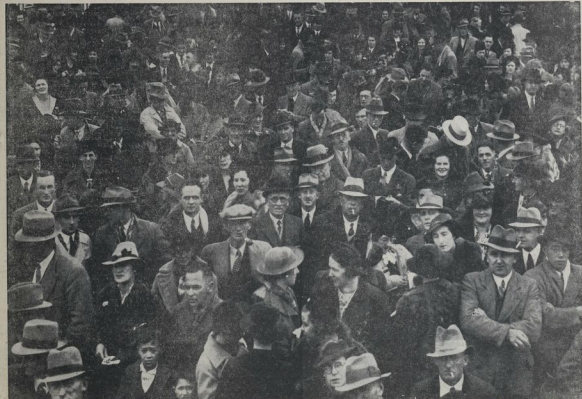
THE MENTAL "BIRD-CAGE."—As the "one" square away, so do the fancies of the punters at the Napier Stakes. A small part of yesterday's crowd.