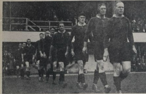
ENTER THE WAIRARAPA TEAM.—Although they did not know it at the time, they were destined to register a "shell" against the combination of the Irons's Bay team yesterday.