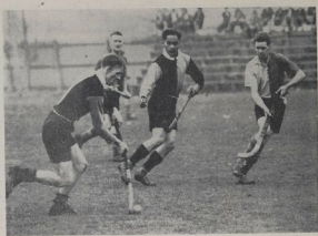
PREPARING TO SHOOT.—A United (Hastings) player all ready to drive in a quick one against Broadway (Hastings) yesterday.