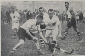
HOCKEY TOURNEY AT HASTINGS.—An incident during the game between Napier and Otago. T.F.C.A. yesterday.