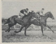
MARY'S finished on just a little better than Hastings yesterday morning.