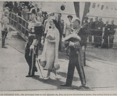
ON CANADIAN SOIL: The performance scene at their Majesties the King and Queen disembarked at Quebec, their majesty being established by a guard position.