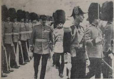
THE GUARD OF HONOUR—The Majesty passing through the ranks of the Royal 2nd Regiment on his arrival at Quebec.