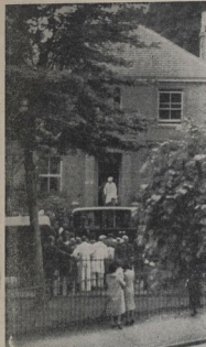
ACCIDENT TO QUEEN MARY—When Queen Mary was involved in an accident in which her car was overturned, she had to seek the services of the nearest surgeon. She is here seen leaving the hospital after resting.