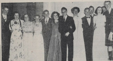
HOLLANDEERS FORGATHER—A group of dancers at the Highland Pipe Band Ball at the Assembly Hall, Hastings, on Wednesday.