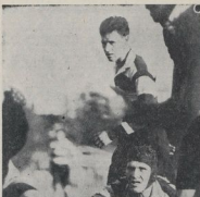
STUY OF A FORWARD... (Caption text is partially obscured)

There was a good display in the game, and the forwards were particularly good.