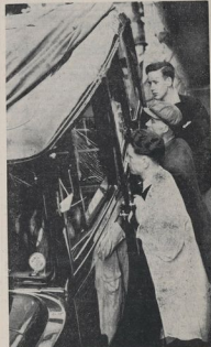
QUEEN MARY'S CAR—Except for a wheelbarrow, Her Majesty escaped unscathed, heavily shaken, but not undaunted, after getting stuck at Woodstock. The car was stuck in mud from this picture was slightly damaged.