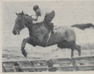
TROUBLE—A wooden fence, shaped unconsciously under A. E. Lord's persuasion is a hindrance to the battery of Hastings yesterday morning.