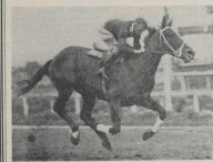
SCREEN LORD, looking greatly impressed by his race at Goodwood, with his companion in the race at the end of their gallop at Hastings yesterday morning.