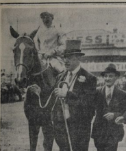
The following riding engagements for the Hawke's Bay meeting tomorrow: ...