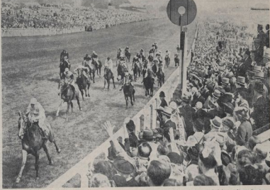
FISH OF THE ENGLISH CLASSIC RACE—By a clear margin, Blue Peter finishes with the lead in the second of the two-hundredth anniversary of King's birthday people of the Derby. He was the favourite.