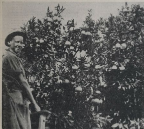
WASHEB WHAT THE?—Here is a bit of the picture and see how the remarkable oranges at St. Matthew's orchard at Hastings are coming on nicely, thank you.