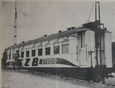
A PERIPATETIC BROADCASTING STATION—In the Hastings Railway yard, station ZB has been an object of interest to many curious onlookers. It is not every day that one sees a broadcasting set on wheels.