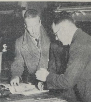
"MILITARY DANCE" - The 21st and 22nd regiments were entertained by the band...