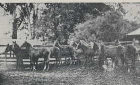
WELSHMEN CUP WINNERS MAY BE HERE.—A bunch of recently-washed Lord Quers and Tino foals at the Flaxmere Stud. Six of these will be retained at the National Yearling Sales next week, and there may be a Melbourne winner among them.