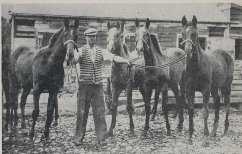
FIRST FOALS OF A NEW BRE.—Four attractive foals, the first crop of the Flaxmere Stud's new Trotters are Tino. From left to right in the picture are a championilly from Gammal, a new filly from Dorian, a new filly from Queen's Palace and a champion colt from Day Lark.