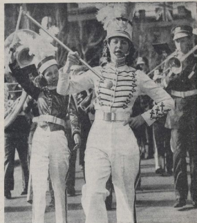
AN AMERICAN MUSICAL GREETING —This year's high school band travelled four hundred miles from the United States to Ontario to greet the King and Queen during their tour to Canada.