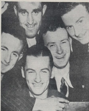
BRITISH ATHLETES FOR NEW ZEALAND —A few of the 19 budding warriors take a half hour of London before leaving for New Zealand last month. These men were brought out by the Government for work on the State housing scheme.