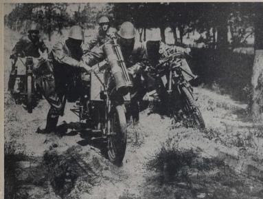
HOLLAND PREPARES HER DEFENCES —The Netherlands—although neutral—has not forgotten the fate of Belgium in the last war, and has ordered its German army movements by partially mobilizing. Motorcycle machine gunners are seen moving up in the front.