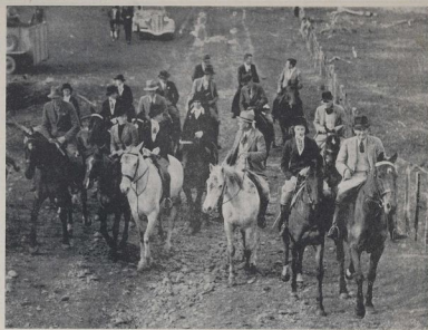
"WHAT DOES THE DAY'S SPORT OFFER?" —Followers of the last day's sports as they move away from the Cross after bombs at Clonsa yesterday afternoon.