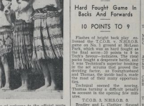
Flashes of bright back play on the 11th minute of the match.

Flashes of bright back play on the 11th minute of the match. The game was a very keen and interesting one.