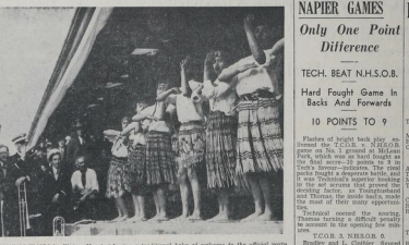
WELCOME TO WARAOA. -Waraoa Maori girls give a traditional haka of welcome to the school party.