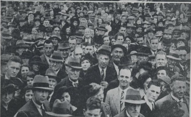
WAIROA'S BIG DAY.—Special "Daily Mail" pictures tell their own story of the opening of the Napier-Wairoa railway on Saturday. Scenes at the ceremony.