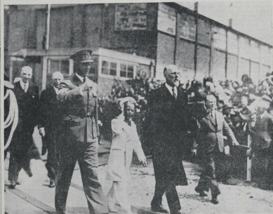
BELOUGN PACKET BOAT LAUNCHED.—King Leopold of the Belgians and the young Prince Baudouin, after whom the new boat was named, moving forward for the launching ceremony.