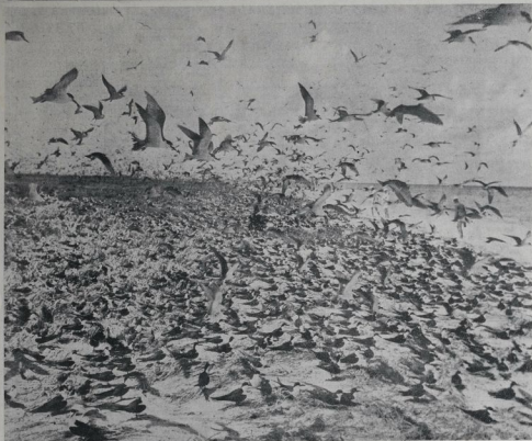
SOOTY TERRES.—An aerial picture of these graceful birds in flight at Robinsons Bay, Otago, Queensland.