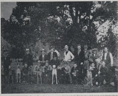
GEORGE'S GEBROUES.—Poverty Bay enthusiasts are preparing their dogs for the Waterloo Cup, which is to be run in Dunedin's Bay in August, and are seen here with some of the competitors.