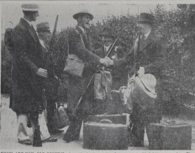
"HOW ARE YOU, OLD BOOBY?" An enthusiastic message between two old sailing comrades. They are members of the Royal Yacht Club, and are visiting at Stranraer Harbour.