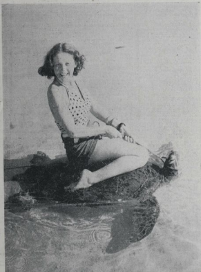
THE TORTOISE AND THE FAIR. —Although in this case the tortoise is a turtle rather a pony Queen Anne for a visit at the Grand Harbour Bath. This model is very popular—it might be called "one alone" or "turtle toboggan."