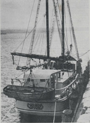
EXPLOITS BATTLE WITH GALE. —The most celebrated ship ever owned by the Tahiti Exploration Co. (Ltd.), Ltd., arrived at the wharves, Port Arthur yesterday. The ship, imported from the Thames line to Melbourne, where a large percentage of the expenses had in New Zealand is manufactured.