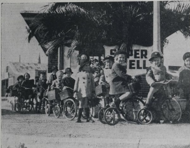
BICYCLE PARADE. —A familiar sight in Dichea Street, Napier, is this group of children, all equipped with tricycles, as they go to and from the Doulton Kindergarten.