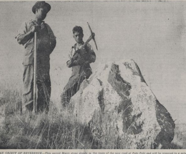
AN OBJECT OF REFERENCE.—The second stone above stands in the center of the new road of Park Place and will be removed to a new site.

Under Two Heads Governments of Defence And Commercial Needs United Press Association—Copyright. (Received July 15, 1.13 a.m.) LONDON, August 12. The Secretary of Overseas Trade (Mr R. E. Hudson) in a speech in the House of Commons, announced the Overseas Trade Expansion Bill and the Government's intention to increase the number of British ships in the world. Mr Hudson said that the Government was determined to increase the number of British ships in the world. He said that the Government was determined to increase the number of British ships in the world.