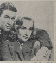
James Brown and Carole Lombard head the cast of "Made For Each Other"...