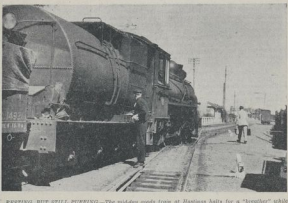
KEEPING, BUT STILL POPPING.—The midday goods train at Hastings halts for a "booster" while awaiting the Napier express from Palmerston North.