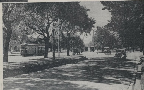
HAPPY SUNSHINE.—A beautiful study of St. Kilda Road, Helensville, with the spires of St. Paul's Cathedral clearly seen in the background.