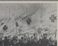
LATVIAN CIVIL GUARDS —A detail posted on the occasion of the 20th anniversary of the Latvian Civil Guards. The standard bearer is on the right.