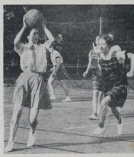
THE BIRD GOES TO AWAY —A duck playing basketball in an indoor basketball match at Seaburn Park, Hastings, on Saturday, where a Broucher player (right) is just over under the net of an opposing member of the Primary team.