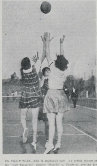
EV' OTHER THIS. —This is nobody's ball. An action picture of the most basketball players (Broucher's Primary) striving for possession during a tense moment.