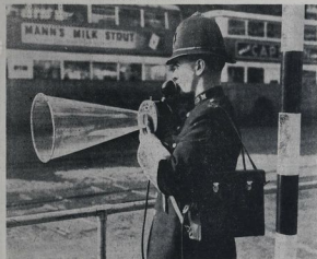
THE GOOD WORK OF THE GALE. —In North London, this is the method adopted by the police force to give traffic order to pedestrians. The policeman uses a megaphone attached to a battery which he carries on his back.