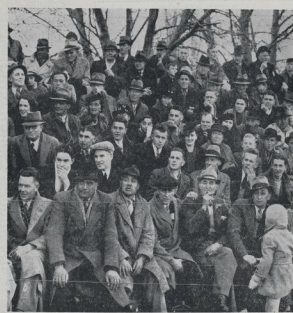
"EYES RIGHT" —Well, mostly, anyway. A section of the crowd at the South-Isle matches played at Seaburn Park, Hastings, on Saturday afternoon.