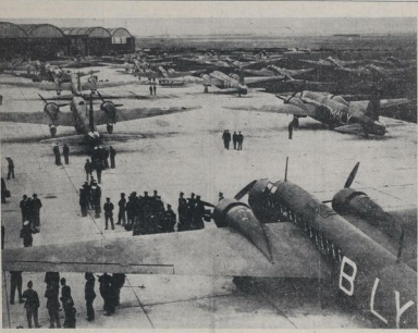
MEIN AIR BATTLE OVER PARIS —According to a report received yesterday, a mass B.P. flight was made over France, in which 110 bombers participated. French fighters were unable to intercept the British bombers who were seen on the Le Bourget aerodrome.

Disaster Press Association—Copyright. (Received July 27, 11:5 a.m.) IN view of the continued trouble on the Manchukuo border, the Japanese Government has announced the immediate suspension of the provisions of the National Defense Law. That is, that a virtual state of war has been proclaimed in Manchukuo, which is most concerned over the clashes with the Soviet-Mongol troops. The Premier of Manchukuo has further declared that troops shall be sent to the border, and that the Japanese will bombard Soviet positions on the west bank of the Khalkin Golo. London dispatch cables say that an Army communication states that 20 Soviet planes were brought down on the Manchukuo frontier on July 25. The Japanese air force heavily bombarded Soviet positions on the west bank of the Khalkin Golo.