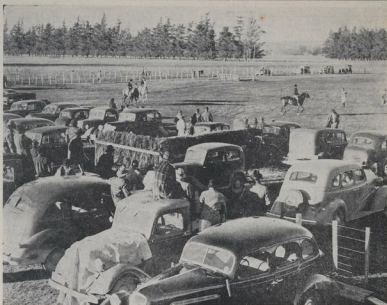
POST-TO-POST AT THIRKES. —A glimpse of the Hawke's Bay Hunt Club's successful meeting at Flittona on Thursday. Despite a cold authority, the crowd enjoyed brilliant weather and exciting sport.