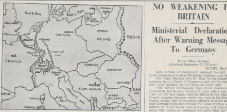
THE SCENE OF THE CONFLICT.—Europe today. Showing the frontiers on September 1, 1939. The dashed lines are the German and Polish frontiers, and the solid lines are the frontiers of France, Germany and Russia as shown.

The League of Nations has announced that it will send a mission to Poland to investigate the situation and to report to the League of Nations.