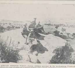
SOUTH AFRICAN DEFENSE FORCE.—Two military services in the southeastern Transvaal. From a large cantonment camp.

"Your hopes of peace, which we support as ardently as you do, have been shattered by the action of the aggressor. We have no knowledge that his nation has any intention of withdrawing from the aggression. It is our duty to support you in your just cause."