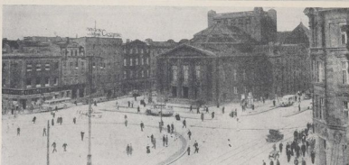
OF POZNAŃ POLSKIA.—Balance in the chief town of that part of Upper Silesia which was transferred from Germany to Poland in 1921. It is the centre of an important industrial district. A view of the square in the centre of the town.