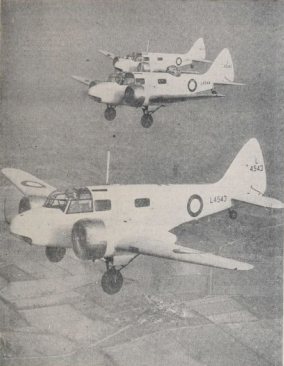
OXFORD BOMBERS.—At 20, 25, 35, 45, 55, 65, 75, 85, 95, 105, 115, 125, 135, 145, 155, 165, 175, 185, 195, 205, 215, 225, 235, 245, 255, 265, 275, 285, 295, 305, 315, 325, 335, 345, 355, 365, 375, 385, 395, 405, 415, 425, 435, 445, 455, 465, 475, 485, 495, 505, 515, 525, 535, 545, 555, 565, 575, 585, 595, 605, 615, 625, 635, 645, 655, 665, 675, 685, 695, 705, 715, 725, 735, 745, 755, 765, 775, 785, 795, 805, 815, 825, 835, 845, 855, 865, 875, 885, 895, 905, 915, 925, 935, 945, 955, 965, 975, 985, 995, 1005, 1015, 1025, 1035, 1045, 1055, 1065, 1075, 1085, 1095, 1105, 1115, 1125, 1135, 1145, 1155, 1165, 1175, 1185, 1195, 1205, 1215, 1225, 1235, 1245, 1255, 1265, 1275, 1285, 1295, 1305, 1315, 1325, 1335, 1345, 1355, 1365, 1375, 1385, 1395, 1405, 1415, 1425, 1435, 1445, 1455, 1465, 1475, 1485, 1495, 1505, 1515, 1525, 1535, 1545, 1555, 1565, 1575, 1585, 1595, 1605, 1615, 1625, 1635, 1645, 1655, 1665, 1675, 1685, 1695, 1705, 1715, 1725, 1735, 1745, 1755, 1765, 1775, 1785, 1795, 1805, 1815, 1825, 1835, 1845, 1855, 1865, 1875, 1885, 1895, 1905, 1915, 1925, 1935, 1945, 1955, 1965, 1975, 1985, 1995, 2005, 2015, 2025, 2035, 2045, 2055, 2065, 2075, 2085, 2095, 2105, 2115, 2125, 2135, 2145, 2155, 2165, 2175, 2185, 2195, 2205, 2215, 2225, 2235, 2245, 2255, 2265, 2275, 2285, 2295, 2305, 2315, 2325, 2335, 2345, 2355, 2365, 2375, 2385, 2395, 2405, 2415, 2425, 2435, 2445, 2455, 2465, 2475, 2485, 2495, 2505, 2515, 2525, 2535, 2545, 2555, 2565, 2575, 2585, 2595, 2605, 2615, 2625, 2635, 2645, 2655, 2665, 2675, 2685, 2695, 2705, 2715, 2725, 2735, 2745, 2755, 2765, 2775, 2785, 2795, 2805, 2815, 2825, 2835, 2845, 2855, 2865, 2875, 2885, 2895, 2905, 2915, 2925, 2935, 2945, 2955, 2965, 2975, 2985, 2995, 3005, 3015, 3025, 3035, 3045, 3055, 3065, 3075, 3085, 3095, 3105, 3115, 3125, 3135, 3145, 3155, 3165, 3175, 3185, 3195, 3205, 3215, 3225, 3235, 3245, 3255, 3265, 3275, 3285, 3295, 3305, 3315, 3325, 3335, 3345, 3355, 3365, 3375, 3385, 3395, 3405, 3415, 3425, 3435, 3445, 3455, 3465, 3475, 3485, 3495, 3505, 3515, 3525, 3535, 3545, 3555, 3565, 3575, 3585, 3595, 3605, 3615, 3625, 3635, 3645, 3655, 3665, 3675, 3685, 3695, 3705, 3715, 3725, 3735, 3745, 3755, 3765, 3775, 3785, 3795, 3805, 3815, 3825, 3835, 3845, 3855, 3865, 3875, 3885, 3895, 3905, 3915, 3925, 3935, 3945, 3955, 3965, 3975, 3985, 3995, 4005, 4015, 4025, 4035, 4045, 4055, 4065, 4075, 4085, 4095, 4105, 4115, 4125, 4135, 4145, 4155, 4165, 4175, 4185, 4195, 4205, 4215, 4225, 4235, 4245, 4255, 4265, 4275, 4285, 4295, 4305, 4315, 4325, 4335, 4345, 4355, 4365, 4375, 4385, 4395, 4405, 4415, 4425, 4435, 4445, 4455, 4465, 4475, 4485, 4495, 4505, 4515, 4525, 4535, 4545, 4555, 4565, 4575, 4585, 4595, 4605, 4615, 4625, 4635, 4645, 4655, 4665, 4675, 4685, 4695, 4705, 4715, 4725, 4735, 4745, 4755, 4765, 4775, 4785, 4795, 4805, 4815, 4825, 4835, 4845, 4855, 4865, 4875, 4885, 4895, 4905, 4915, 4925, 4935, 4945, 4955, 4965, 4975, 4985, 4995, 5005, 5015, 5025, 5035, 5045, 5055, 5065, 5075, 5085, 5095, 5105, 5115, 5125, 5135, 5145, 5155, 5165, 5175, 5185, 5195, 5205, 5215, 5225, 5235, 5245, 5255, 5265, 5275, 5285, 5295, 5305, 5315, 5325, 5335, 5345, 5355, 5365, 5375, 5385, 5395, 5405, 5415, 5425, 5435, 5445, 5455, 5465, 5475, 5485, 5495, 5505, 5515, 5525, 5535, 5545, 5555, 5565, 5575, 5585, 5595, 5605, 5615, 5625, 5635, 5645, 5655, 5665, 5675, 5685, 5695, 5705, 5715, 5725, 5735, 5745, 5755, 5765, 5775, 5785, 5795, 5805, 5815, 5825, 5835, 5845, 5855, 5865, 5875, 5885, 5895, 5905, 5915, 5925, 5935, 5945, 5955, 5965, 5975, 5985, 5995, 6005, 6015, 6025, 6035, 6045, 6055, 6065, 6075, 6085, 6095, 6105, 6115, 6125, 6135, 6145, 6155, 6165, 6175, 6185, 6195, 6205, 6215, 6225, 6235, 6245, 6255, 6265, 6275, 6285, 6295, 6305, 6315, 6325, 6335, 6345, 6355, 6365, 6375, 6385, 6395, 6405, 6415, 6425, 6435, 6445, 6455, 6465, 6475, 6485, 6495, 6505, 6515, 6525, 6535, 6545, 6555, 6565, 6575, 6585, 6595, 6605, 6615, 6625, 6635, 6645, 6655, 6665, 6675, 6685, 6695, 6705, 6715, 6725, 6735, 6745, 6755, 6765, 6775, 6785, 6795, 6805, 6815, 6825, 6835, 6845, 6855, 6865, 6875, 6885, 6895, 6905, 6915, 6925, 6935, 6945, 6955, 6965, 6975, 6985, 6995, 7005, 7015, 7025, 7035, 7045, 7055, 7065, 7075, 7085, 7095, 7105, 7115, 7125, 7135, 7145, 7155, 7165, 7175, 7185, 7195, 7205, 7215, 7225, 7235, 7245, 7255, 7265, 7275, 7285, 7295, 7305, 7315, 7325, 7335, 7345, 7355, 7365, 7375, 7385, 7395, 7405, 7415, 7425, 7435, 7445, 7455, 7465, 7475, 7485, 7495, 7505, 7515, 7525, 7535, 7545, 7555, 7565, 7575, 7585, 7595, 7605, 7615, 7625, 7635, 7645, 7655, 7665, 7675, 7685, 7695, 7705, 7715, 7725, 7735, 7745, 7755, 7765, 7775, 7785, 7795, 7805, 7815, 7825, 7835, 7845, 7855, 7865, 7875, 7885, 7895, 7905, 7915, 7925, 7935, 7945, 7955, 7965, 7975, 7985, 7995, 8005, 8015, 8025, 8035, 8045, 8055, 8065, 8075, 8085, 8095, 8105, 8115, 8125, 8135, 8145, 8155, 8165, 8175, 8185, 8195, 8205, 8215, 8225, 8235, 8245, 8255, 8265, 8275, 8285, 8295, 8305, 8315, 8325, 8335, 8345, 8355, 8365, 8375, 8385, 8395, 8405, 8415, 8425, 8435, 8445, 8455, 8465, 8475, 8485, 8495, 8505, 8515, 8525, 8535, 8545, 8555, 8565, 8575, 8585, 8595, 8605, 8615, 8625, 8635, 8645, 8655, 8665, 8675, 8685, 8695, 8705, 8715, 8725, 8735, 8745, 8755, 8765, 8775, 8785, 8795, 8805, 8815, 8825, 8835, 8845, 8855, 8865, 8875, 8885, 8895, 8905, 8915, 8925, 8935, 8945, 8955, 8965, 8975, 8985, 8995, 9005, 9015, 9025, 9035, 9045, 9055, 9065, 9075, 9085, 9095, 9105, 9115, 9125, 9135, 9145, 9155, 9165, 9175, 9185, 9195, 9205, 9215, 9225, 9235, 9245, 9255, 9265, 9275, 9285, 9295, 9305, 9315, 9325, 9335, 9345, 9355, 9365, 9375, 9385, 9395, 9405, 9415, 9425, 9435, 9445, 9455, 9465, 9475, 9485, 9495, 9505, 9515, 9525, 9535, 9545, 9555, 9565, 9575, 9585, 9595, 9605, 9615, 9625, 9635, 9645, 9655, 9665, 9675, 9685, 9695, 9705, 9715, 9725, 9735, 9745, 9755, 9765, 9775, 9785, 9795, 9805, 9815, 9825, 9835, 9845, 9855, 9865, 9875, 9885, 9895, 9905, 9915, 9925, 9935, 9945, 9955, 9965, 9975, 9985, 9995, 10005, 10015, 10025, 10035, 10045, 10055, 10065, 10075, 10085, 10095, 10105, 10115, 10125, 10135, 10145, 10155, 10165, 10175, 10185, 10195, 10205, 10215, 10225, 10235, 10245, 10255, 10265, 10275, 10285, 10295, 10305, 10315, 10325, 10335, 10345, 10355, 10365, 10375, 10385, 10395, 10405, 10415, 10425, 10435, 10445, 10455, 10465, 10475, 10485, 10495, 10505, 10515, 10525, 10535, 10545, 10555, 10565, 10575, 10585, 10595, 10605, 10615, 10625, 10635, 10645, 10655, 10665, 10675, 10685, 10695, 10705, 10715, 10725, 10735, 10745, 10755, 10765, 10775, 10785, 10795, 10805, 10815, 10825, 10835, 10845, 10855, 10865, 10875, 10885, 10895, 10905, 10915, 10925, 10935, 10945, 10955, 10965, 10975, 10985, 10995, 11005, 11015, 11025, 11035, 11045, 11055, 11065, 11075, 11085, 11095, 11105, 11115, 11125, 11135, 11145, 11155, 11165, 11175, 11185, 11195, 11205, 11215, 11225, 11235, 11245, 11255, 11265, 11275, 11285, 11295, 11305, 11315, 11325, 11335, 11345, 11355, 11365, 11375, 11385, 11395, 11405, 11415, 11425, 11435, 11445, 11455, 11465, 11475, 11485, 11495, 11505, 11515, 11525, 11535, 11545, 11555, 11565, 11575, 11585, 11595, 11605, 11615, 11625, 11635, 11645, 11655, 11665, 11675, 11685, 11695, 11705, 11715, 11725, 11735, 11745, 11755, 11765, 11775, 11785, 11795, 11805, 11815, 11825, 11835, 11845, 11855, 11865, 11875, 11885, 11895, 11905, 11915, 11925, 11935, 11945, 11955, 11965, 11975, 11985, 11995, 12005, 12015, 12025, 12035, 12045, 12055, 12065, 12075, 12085, 12095, 12105, 12115, 12125, 12135, 12145, 12155, 12165, 12175, 12185, 12195, 12205, 12215, 12225, 12235, 12245, 12255, 12265, 12275, 12285, 12295, 12305, 12315, 12325, 12335, 12345, 12355, 12365, 12375, 12385, 12395, 12405, 12415, 12425, 12435, 12445, 12455, 12465, 12475, 12485, 12495, 12505, 12515, 12525, 12535, 12545, 12555, 12565, 12575, 12585, 12595, 12605, 12615, 12625, 12635, 12645, 12655, 12665, 12675, 12685, 12695, 12705, 12715, 12725, 12735, 12745, 12755, 12765, 12775, 12785, 12795, 12805, 12815, 12825, 12835, 12845, 12855, 12865, 12875, 12885, 12895, 12905, 12915, 12925, 12935, 12945, 12955, 12965, 12975, 12985, 12995, 13005, 13015, 13025, 13035, 13045, 13055, 13065, 13075, 13085, 13095, 13105, 13115, 13125, 13135, 13145, 13155, 13165, 13175, 13185, 13195, 13205, 13215, 13225, 13235, 13245, 13255, 13265, 13275, 13285, 13295, 13305, 13315, 13325, 13335, 13345, 13355, 13365, 13375, 13385, 13395, 13405, 13415, 13425, 13435, 13445, 13455, 13465, 13475, 13485, 13495, 13505, 13515, 13525, 13535, 13545, 13555, 13565, 13575, 13585, 13595, 13605, 13615, 13625, 13635, 13645, 13655, 13665, 13675, 13685, 13695, 13705, 13715, 13725, 13735, 13745, 13755, 13765, 13775, 13785, 13795, 13805, 13815, 13825, 13835, 13845, 13855, 13865, 13875, 13885, 13895, 13905, 13915, 13925, 13935, 13945, 13955, 13965, 13975, 13985, 13995, 14005, 14015, 14025, 14035, 14045, 14055, 14065, 14075, 14085, 14095, 14105, 14115, 14125, 14135, 14145, 14155, 14165, 14175, 14185, 14195, 14205, 14215, 14225, 14235, 14245, 14255, 14265, 14275, 14285, 14295, 14305, 14315, 14325, 14335, 14345, 14355, 14365, 14375, 14385, 14395, 14405, 14415, 14425, 14435, 14445, 14455, 14465, 14475, 14485, 14495, 14505, 14515, 14525, 14535, 14545, 14555, 14565, 14575, 14585, 14595, 14605, 14615, 14625, 14635, 14645, 14655, 14665, 14675, 14685, 14695, 14705, 14715, 14725, 14735, 14745, 14755, 14765, 14775, 14785, 14795, 14805, 14815, 14825, 14835, 14845, 14855, 14865, 14875, 14885, 14895, 14905, 14915, 14925, 14935, 14945, 14955, 14965, 14975, 14985, 14995, 15005, 15015, 15025, 15035, 15045, 15055, 15065, 15075, 15085, 15095, 15105, 15115, 15125, 15135, 15145, 15155, 15165, 15175, 15185, 15195, 15205, 15215, 15225, 15235, 15245, 15255, 15265, 15275, 15285, 15295, 15305, 15315, 15325, 15335, 15345, 15355, 15365, 15375, 15385, 15395, 15405, 15415, 15425, 15435, 15445, 15455, 15465, 15475, 15485, 15495, 15505, 15515, 15525, 15535, 15545, 15555, 15565, 15575, 15585, 15595, 15605, 15615, 15625, 15635, 15645, 15655, 15665, 15675, 15685, 15695, 15705, 15715, 15725, 15735, 15745, 15755, 15765, 15775, 15785, 15795, 15805, 15815, 15825, 15835, 15845, 15855, 15865, 15875, 15885, 15895, 15905, 15915, 15925, 15935, 15945, 15955, 15965, 15975, 15985, 15995, 16005, 16015, 16025, 16035, 16045, 16055, 16065, 16075, 16085, 16095, 16105, 16115, 16125, 16135, 16145, 16155, 16165, 16175, 16185, 16195, 16205, 16215, 16225, 16235, 16245, 16255, 16265, 16275, 16285, 16295, 16305, 16315, 16325, 16335, 16345, 16355, 16365, 16375, 16385, 16395, 16405, 16415, 16425, 16435, 16445, 16455, 16465, 16475, 16485, 16495, 16505, 16515, 16525, 16535, 16545, 16555, 16565, 16575, 16585, 16595, 16605, 16615, 16625, 16635, 16645, 16655, 16665, 16675, 16685, 16695, 16705, 16715, 16725, 16735, 16745, 16755, 16765, 16775, 16785, 16795, 16805, 16815, 16825, 16835, 16845, 16855, 16865, 16875, 16885, 16895, 16905, 16915, 16925, 16935, 16945, 16955, 16965, 16975, 16985, 16995, 17005, 17015, 17025, 17035, 17045, 17055, 17065, 17075, 17085, 17095, 17105, 17115, 17125, 17135, 17145, 17155, 17165, 17175, 17185, 17195, 17205, 17215, 17225, 17233, 17245, 17255, 17265, 17275, 17285, 17295, 17305, 17315, 17325, 17335, 17345, 17355, 17365, 17375, 17385, 17395, 17405, 17415, 17425, 17435, 17445, 17455, 17465, 17475, 17485, 17495, 17505, 17515, 17525, 17535, 17545, 17555, 17565, 17575, 17585, 17595, 17605, 17615, 17625, 17635, 17645, 17655, 17665, 17675, 17685, 17695, 17705, 17715, 17725, 17733, 17745, 17755, 17765, 17775, 17785, 17795, 17805, 17815, 17825, 17833, 17845, 17855, 17865, 17875, 17885, 17895, 17905, 17915, 17922, 17933, 17945, 17955, 17965, 17975, 17985, 17995, 18005, 18015, 18022, 18033, 18045, 18055, 18065, 18077, 18085, 18095, 18105, 18115, 18122, 18133, 18145, 18155, 18166, 18175, 18185, 18195, 18205, 18215, 18222, 18233, 18245, 18255, 18266, 18277, 18285, 18295, 18305, 18315, 18322, 18333, 18345, 18355, 18366, 18377, 18385, 18395, 18405, 18415, 18422, 18433, 18445, 18455, 18466, 18477, 18485, 18495, 18505, 18515, 18522, 18533, 18545, 18555, 18566, 18577, 18585, 18595, 18605, 18615, 18622, 18633