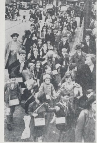
ROUND FOR THE COUNTRY.—London's children, some of them being more than 1000 in number, were taken to the situation room to enjoy the "Breeze of Sun London". More than 100,000 took to the roads.