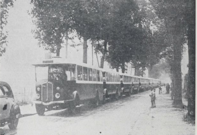
WAR SCENES IN FRANCE.—Four days of confusion have been witnessed by the French Government to provide transport for troops and their stores in the general mobilization.