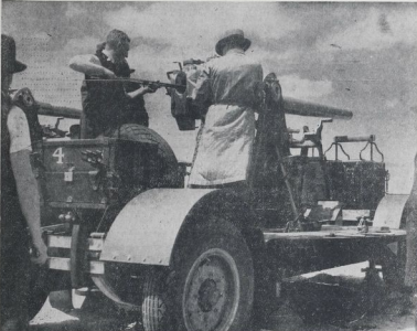
AUSTRALIAN AIR SERVICES—A modern tank anti-aircraft gun, manufactured in Melbourne. Experts are seen getting the gun through final tests. These engines, and other kinds of various types, are being turned out in quantities as an emergency need.