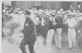
SPINE BOOTS IN AMERICA—Police were forced to use iron toe boots during recent riot outbreaks in Cleveland, Ohio. The picture shows a motor-car being taken out by the police in front of the rioters. Many were injured.

BROADENING ITS OUTLOOK CRICKET ASSOCIATION IN WAIRAO MANY DECISIONS Annual Review of Activities “This year” again means WAIRAO. With a view to extending the standards of cricket in Wairao and encouraging clubs from outside, the Wairao Cricket Association decided at its annual meeting on the 27th inst. to broaden its outlook. The result of the meeting was the formation of the Wairao Cricket Association. Being replied as a result of persistent heavy rain on Thursday Waikato River was overflowed in high places and water was poured down the bottom of the river in places. The result of the rain was that the river was in flood. “Yesterday the river had risen six inches above its normal level. It is now at least six feet above normal level.” No damage or loss of any consequence has been reported.