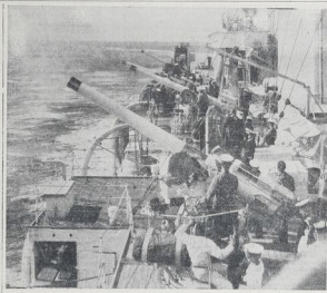
THESE WILL BE THE FIRST CALCULATIONS. Yesterday it was reported that by the simple process of a mathematical calculation the Nazis claimed that they now see the way.

Nazis Admit Act. The Nazis have admitted an act of aggression.