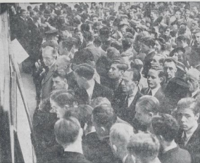
BRITAIN'S TERRITORIAL ARMY—General Smuts inspecting the motor bands at Mission House, London, where the lists of those called up are posted.