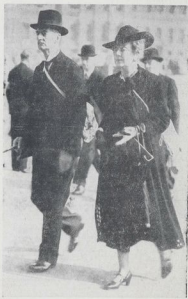
SETTING THE EXAMPLE —Mr. and Mrs. Neville Chamberlain on the way home after their first visit to the new school in St. Albans Park. The boys stand over their shoulders to see their gas masks.