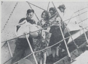
VICTIMS OF A HAZY BOAT —Patriotic officers were welcomed on board of the Albatross survivors were taken off Gisbush. A motor launch is being driven a passage, unassisted by the motor. The crews of the original steamer had perished. Two other women passengers killed.