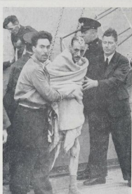
REUNION FROM THE ABYSS —This momentary meeting the marks of victory on the face of the men, and that only on the Albatross, is kept from the Norwegian factor which revealed the tragedy.