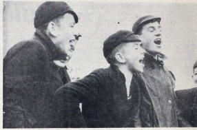
SCHOOLBOYS' SCOWOOL.—Napier High School boys cheer their team during the match with the Hastings High School on Tuesday last.