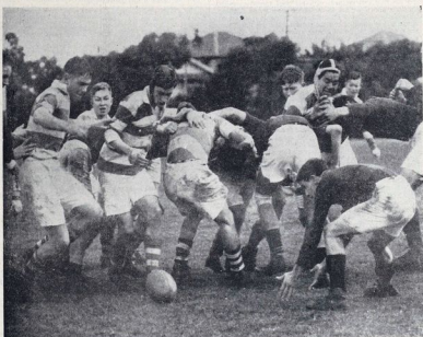
HIGH SCHOOLBOYS IN FRIENDLY COMBAT.—The Hastings High School defeated the Napier Boys High School by six points to nil in a well shot and on Tuesday last. The Hastings half-back is seen taking the ball from a loose pack.