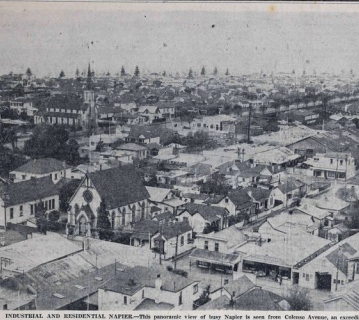
INDUSTRIAL AND RESIDENTIAL NATIVES—50th anniversary day of New Zealand. Men from Colenso Avenue, an ex-slavery food storage post, five minutes' walk from the town.