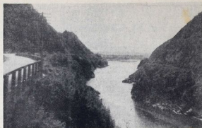
A TRIAL FOR BUNYONS AND WOPORINA.—The Manawatu Gorge, which has been blocked in several instances this winter by slips both on the road and on the railway line. Effort was, however, has enabled the way to be cleared in good time.