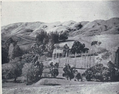
SPRING IN WINTER.—This view from the Hastings reservoir looking towards Te Mata certainly does not look like a winter landscape. Yet the picture was taken yesterday.