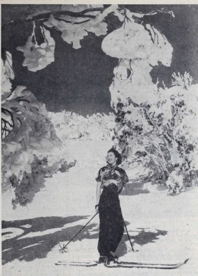
SKOW IN AUSTRALIA.—In light snow the skiers of many nations a recent fall on Mount Hotham (Victoria) that it hung like cotton wool on trees and shrubs. The skier, of course, is incidental.