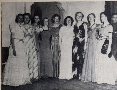
BEAUTY ON PARADE. —The Beautified Ball at Hastings on Wednesday night attracted a big throng of spectators. It might have been the uniforms, and there again it might not... A happy group at the Assembly Ball, Hastings.