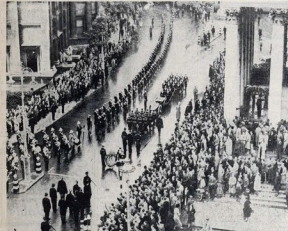
DEATH OF BRITISH ADMIRAL. —The funeral of Sir Roger Backhouse, Admiral of the Fleet, at St. Martin-in-the-Fields, London, on July 25. The ceremony was attended among others by Earl Stirling, First Sea Lord, and Sir Geoffrey Shakespeare, Parliamentary Secretary.