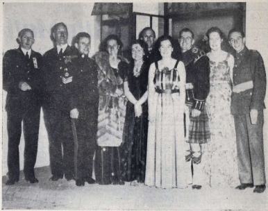
UNIFORMS ON PARADE. —Some and some wore the uniforms worn by officers and men at the Beautified Ball at Hastings on Wednesday night, and for once colour was not the only attraction of the fun. Here to note the blue dress uniform of the volunteers; the uniform of the Legion of Frontiersmen; the "bushy" shirt; and the regular army khaki.