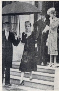
ROYAL BUTTER. —Princess Olga of Yugoslavia, who is visiting England with her husband, Prince Paul, is spending no more time on possible with her sister, the Duchess of Kent. Princess Olga and the Duchess of Kent leaving Stirling Square for luncheon at Buckingham Palace.