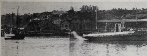
VESSEL GROUND AT PORT ARTHUR. —The motor tender Dolphin grounded on the Boulder Bank, midway between the point opposite and West Quay, shortly before high water yesterday morning. Because of the lack of water it was necessary to make the services of both Richardson & Co's Tugs, Kari and Conchie , which are now attempting to refloat the vessel. The Dolphin later was towed to a small communication vessel (1000) or so deep.