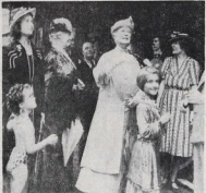
QUEEN MARY ATTENDS A GARDEN PARTY. —To and the fronts of the National Council for mothers and child welfare, a garden party was held last week at St. Anne's Palace. Queen Mary is seen embracing a boy in the distance. In the centre, a child of the welfare club is being given.