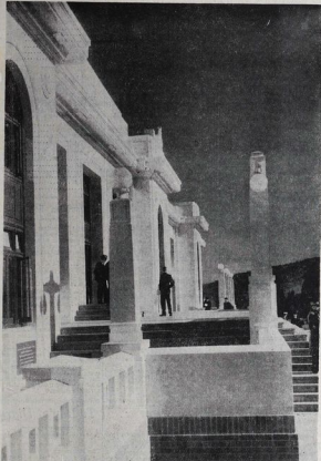
HOME OF THE FEDERAL PARLIAMENT. —The gleaming white facade of Parliament House, on Terrace, soon to be opened by H. E. H. the Duke of Kent as Governor of Australia.