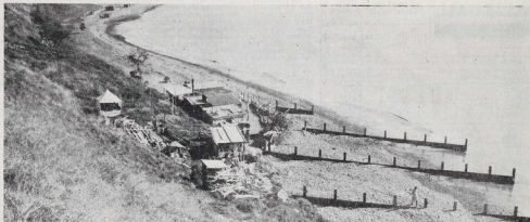
TO DEFEAT THE SEA. —Erosion threatened portions of the Cliffside Bank and the reeve's cottage, and a system of groynes has been devised to build up the cliffside bank and to prevent the advance. The works are well in hand as may be seen from this picture.