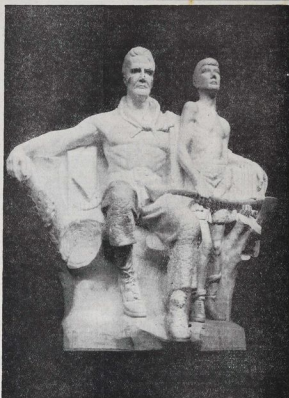
STEREOLIC GROUP. —A woman and the son from the future in the sculpture, one of the many symbolic groups which will form a feature of the Centennial Exhibition at Wellington.