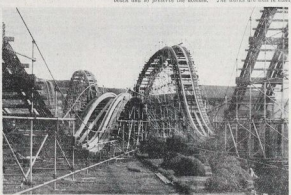
UPS AND DOWNS. —Looking like a group of youngsters, the gaily rolling and curving tracks of the giant Capitol Roller Coaster are taking shape in the Pleasure section of the Wellington Centennial Exhibition. This is the largest ever built in the Southern Hemisphere.