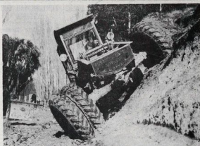
NEW MECHANICAL HARRIERS —The new graders used by the Hawke's Bay County Council in reconstruction work on the Middle Road near Patetanga are both versatile and powerful, being embankment and cutting in their stride.