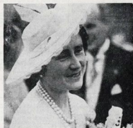
THE QUEEN AT A GARDEN PARTY —A happy picture of Queen Elizabeth at the Tea. It is a picture of the Queen at a garden party on July 19. Her Majesty is a member of the Tea. It is a picture of the Queen at a garden party on July 19. Her Majesty is a member of the Tea.