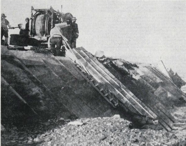
STEWARTSON'S NEW CHANGES THE COURSE —The course of the Patetanga River recently shifted near the mouth. Stewartson's new machine is used to clear the river of silt and stones, and to maintain the protection of the wall. The machine is used to clear the river of silt and stones, and to maintain the protection of the wall. The machine is used to clear the river of silt and stones, and to maintain the protection of the wall.