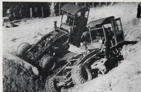
SPREADING OF ROAD CONSTRUCTION —The Hawke's Bay County Council's new mechanical graders make light work of SPREADING road-making problems. They are now being cutting back on embankment while the other restores the spoil and grades the new surface.