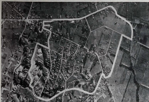
CHAMPIONSHIP HARVIER COURSE —This is an aerial view of the course on Harlowth North over which the New Zealand harrier championships are to be decided on Saturday afternoon. Builders will undoubtedly be engaged to clear sections of the course. Harlowth North township and the crossroads are in the top left-hand portion of the photograph. The starting point of the race is on the road outside the hotel, and the race will finish in the museum. The white line indicates a 1 1/4 mile course, and the road will be restored to the owners.