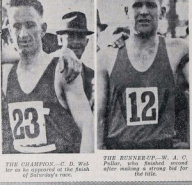
THE BURNING OF THE BAY... after missing a strong ball...