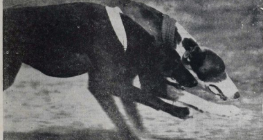
"BUCKING UP THE TRACK" —These two probably were priced at an estimated speed of 40 m.p.h. as they raced after the hare during the Waterloo Cup evening at Danings on Saturday.