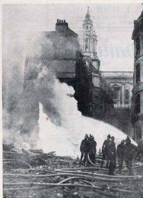
DEAD FROM A DEACTIVATED BOMB —Over the casualties were caused in London when exploded gas pipe a fire-bomb issue (right) had did great damage to surrounding property. Firemen are here now fighting the blaze.