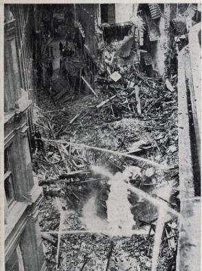
NOT A BOMB EXPLOSION —Early this month, in the shadow of St. Paul's Cathedral, London, widespread damage was done when a gas main burst and ignited. A general view of the havoc caused.