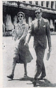
SUNBINE AND SHADOW —The Duke and Duchess of Kent having a break walk while holidaying in France.