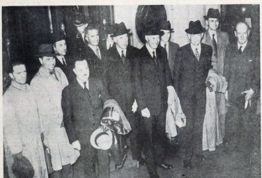
FRENCH SERVICES MISSON —The French mission with some of the British mission is arrived at Victoria Station, London. This picture was taken before the party went to Spahe.