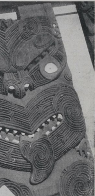
A WORK OF MAORI ART—The figure, part of the carved entrance of Robert Park, Hastings, has always been the object of admiration of visitors as a work of wood and artistic genius.