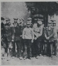
WAITING FOR SERVICE.—A group of Polish soldiers, decorated by King Stanislaw, stand in line at the Post Office of Curkera, the Federal Capital of Austria. Curkera is only a few miles from Vienna.