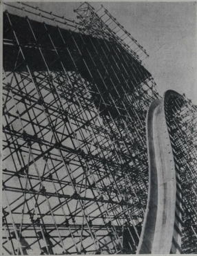
THE GEOMETRY OF RESTRAINT.—In other words, the pattern formed by the steel engineering and welding curves of the "Clark and Jell" in "Pulsed" at the Wellington Congress Exhibition.