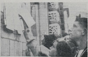
MEMBERS OF U.S.S. COURAGEOUS SURVIVORS —Relatives and friends of the crew of the British aircraft carrier Courageous , which was the last month to be sunk in the Atlantic, march through the Plaza of survivors with wrapped packages of shoes and bags.