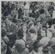
WAITING FOR NEW OF THE COURAGEOUS —Anxious crowds gathered at the Plaza area to meet news when the British aircraft carrier Courageous was reported last month.