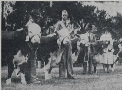
FINE HAWKES BAY HERDFOLK—These breeds formed their display for a moment to "get the 'Daily Mail' cameras, while waiting for the judges.