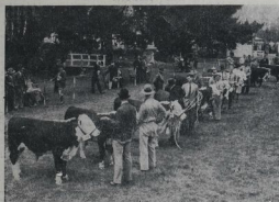
JUDGING A CATTLE CLASS—Exhibitors line their entries up to await the appraising eye of the judge. Second entries were received for almost every class.