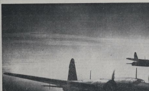
BRITAIN'S AERIAL ARMY—Ten of Britain's powerful Wellington bombers sweeping through the sky at dawn, 20.00 last eve. Markings of this type are being used extensively by the R.A.F. in the east.

British Press Association—Copyright. (Received October 18, 11.45 p.m.) LONDON, Oct. 18. Germany's push inspired by Hitler's desire to eject the French from Poland, is now at a complete standstill. It is officially estimated that the Nazis have lost at least 5,000 men, which is out of all proportion to the slight gains. The French losses in the course of their valiant resistance to pre-arranged positions were slight. Once the Nazis reached the first line of the French defenses they met a veritable wall of fire which almost completely stopped them. Some official commentary says that the Nazis at no point succeeded in getting near enough to the trench ditches to establish hand-to-hand fighting. They were forced to dig in at the points where they had gained a few feet with a view to creating machine-gun nests, and they will be constantly subjected to a violent French artillery barrage and machine-gun fire. The "New York Times" correspondents have estimated that the French have lost 5,000 men in the long fighting since the French broke through the line of German front-line positions which had been held for two weeks. The article came in the Washington Post. It is believed that the French have lost 10,000 men in the long fighting since the French broke through the line of German front-line positions which had been held for two weeks. The article came in the Washington Post.