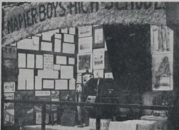
SCHOOLBOYS' DISPLAY—An attractive display among the school exhibitors was this one arranged by the Dargaville Boys' High School.