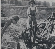
LARD ARMY GELS TAKE OVER... Lard girls receiving training in tractor driving at an Army farm, are entrusted in the mechanical details of a plough.