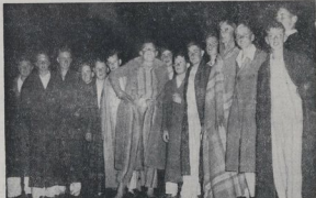
A WHOLE FLOCK OF BOYS... Boys of the Upper High School formed an excited group in the large court of spectators which quickly gathered when the annual Training department of the school was held...