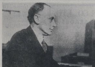
THE KAT WITH THE BEEF PENICIL... The additional Colonel, the British Consul, is in office at the Ministry of Information.