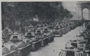
FRANCE'S REARMED MIGHT... A wondrous parade of French tanks passes the Arc de Triomphe in Paris...