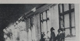
NAPHER BOY WITH SCOUTS FIRE - When the second training department of the Napher Boys' High School camp fire in Dunedin night, it was the largest of the kind in the world.

(United Press Association-Copyright.) (Received October 26, 21.10 a.m.) NEW YORK, Oct. 25. The case of the City of Flint, Michigan, is a matter interesting to the City of London, because it is a matter of diplomatic dynamite. The case is a matter of international law, and it is a matter of international law. The case is a matter of international law, and it is a matter of international law.