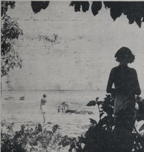
SUMMER IS ON ITS WAY FROM HERE... Tourists enjoy the tropical beauty of Storm Island, Great Barrier Reef...