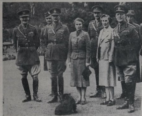
THE DUKE OF GLOUCESTER LEAVES FOR FRANCE... The Duke is seen with the Duchess...