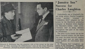
"Jannaia Inn" Success for Charles Laughton