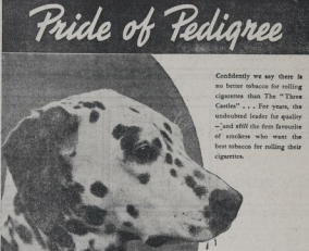
Pride of Pedigree - Concededly one of the best bitches for selling figures than the 'Three Castles'...