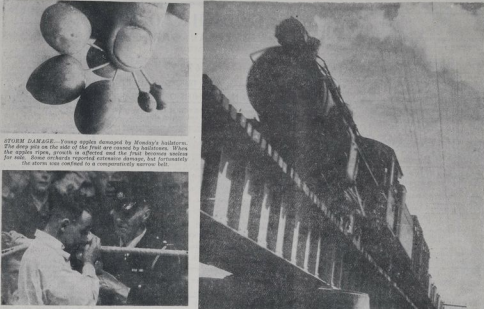
STORM DAMAGE. —Very heavy damage by Monday's hailstorm. The drop pins on the side of the Post are raised by hailstones. The roof of the Post is damaged and the roof is being raised by the wind. A large number of trees are broken and the ground is covered in a thick layer of hail.