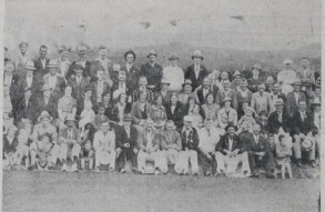
BOWLING DAY AT TAI. —The "Bird" bowling club of the Waikaremoana Bowling Club attracted a large crowd of bowlers and onlookers from throughout the Waikaremoana district for Tai this week. A group of bowlers, visitors and friends.