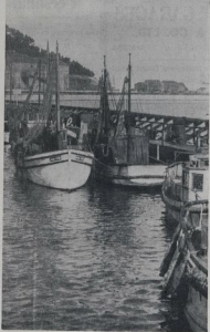
DISMISSED PROP—An October 25th, Captain James Cook first set foot on New Zealand and in Poverty Bay. The spot is marked by a monument, which is just visible in the background of this picture. Below, there is the ornate propeller of the ship which was the property of the Māori people. The heavy works on the left, and the screw propeller, which has been discarded, is at the right.