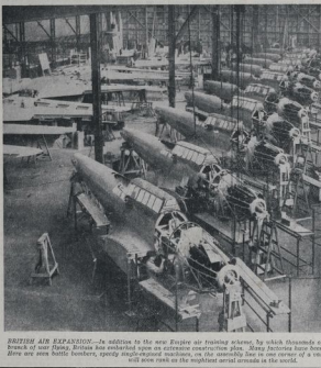
BRITISH AIR DEFENSES... adding to the new Empire air training schools, which thousands of men will be required to carry out in the near future.