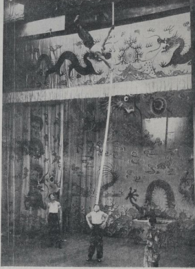
ENTER THREE CHINESE—An extraordinary balancing feat performed by members of the Great China Circus at Hastings on Thursday night. Their apparatus diverged for the sake of gravity and equilibrium still for the eyes of spectators, politicians, and others.