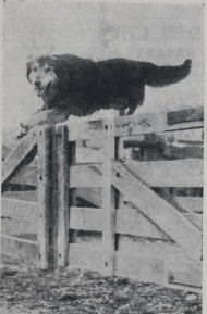
"WHERE'S THAT BEST DRAFT?"—A shopping holiday is over in Whangarei when the Shortland Lodge yesterday is getting to the start page.