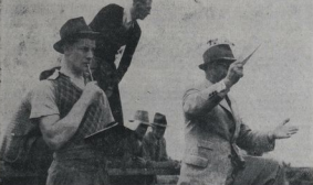
NOT A FIRM STORY—The audience might look as though to be very excited about the one that got away, but there were few aircraft who got away from the Shortland Lodge and yesterday without a heavy hand. Bidding in recent auctions was keen—in this instance the winning bid time to pass reflectively before getting down the stairs of the platform.