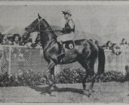
BEAUVIRE'S BEHAVIOUR (CONTINUED)—The American-owned colt Beauvire... won the Melbourne Cup...