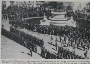
BRELLANT PARADE —The dignity and impressiveness of the opening ceremony of the Centennial Exhibition was greatly enhanced by the presence of the decorated forces. The march was represented by the 1st Battalion, Wellington Regiment, which was inspected by His Excellency during the afternoon.