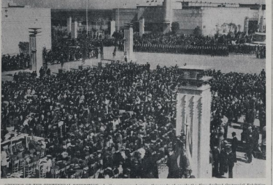
OPENING OF THE CENTRAL EXHIBITION... In the presence of many thousands of people the New Zealand Government Exhibition, commemorating the centenary of the first landing party of pioneers, was opened yesterday at Wellington by His Excellency the Governor-General (Viscount Galt).

This declaration cannot be interpreted as a sign of weakness.