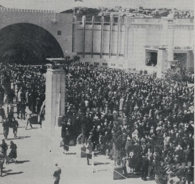
PART OF THE VAST CROWD —In spite of the efforts of the Exhibition authorities to make provision for the public to witness the official opening, it became evident quite early on the day that it would be impossible for all those attending to be accommodated in the Court of Passengers open to the public. A large number of people attended on the first day.