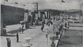
CENTENNIAL AVENUE —A view from the Tower looking towards the main entrance of the Wellington Exhibition. The first arrivals yesterday morning took over the grounds while awaiting the official opening ceremony.