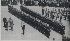
THE NAVAL GUARD —The Naval guard of honour at the Centennial opening ceremony was composed of a detachment from the Royal Naval Volunteer Reserve. His Excellency Lord Gidley is seen inspecting the ranks with Captain W. T. Lane. The band at the rear of the Naval guard was provided by the Royal New Zealand Air Force.