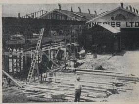
HAWKE'S BAY CAN CAN—Aid on the way, etc. The picture shows the important extension operations being carried out by the Government in the wake of the jubilee building in Queen Victoria St.

MONEY NOT VERY PLENTIFUL DIFFICULTIES OF RAISING LOAN £34,000 WANTED New Buildings For Hospital