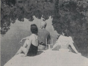
A REFLECTIVE STUDY—By the quiet waters of the Russell River, Cairns, Queensland.