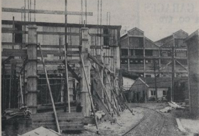
GREATER EXHIBITION—Exhibition business halls for additional space. The Dominion Trust's chamber has had to be returned to the street view in the picture, to meet the growing requirements of the trade.

THE TOURIST MOTOR CO., LIMITED HASTINGS, 'PHONE 3526. T. NEWMAN MOTORS NAPER.