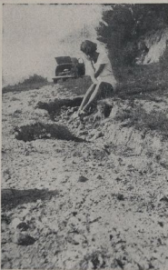
A RUINED ROADWAY.—Some idea of the difficulties of approach to Waipapa Beach can be had from the picture of the access road (see picture on left).