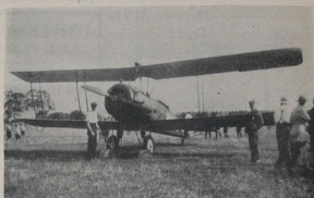
AN OLD TIMER.—The photograph, taken in 1911, shows one of the wartime Army aeroplanes as used by the New Zealand Aerial Transport Co. and housed in the hangar shown below, on the Manawatu Road, three miles from Hastings.