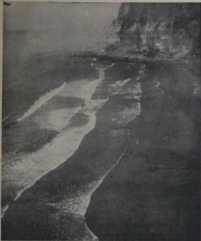
WHERE THE LAY WATER MEASURES.—The lovely Waipapa Beach, the access road to which (see picture on right) is to be improved by the Hawke's Bay County Council. Work will begin today.