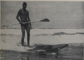
WIPING AT WAIPAPA.—This broad spot illustrates the fun of surfing on the beautiful beach on the East Coast of Hawke's Bay.