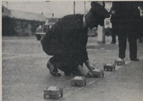
"CAT'S EYE".—The Hastings traffic inspector placing reflecting studs in position on a pedestrian crossing to enable it to be more easily seen at night by motorists.