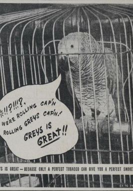
GREYS IS GREAT—BECAUSE ONLY A PERFECT TOBACCO CAN GIVE YOU A PERFECT SMOKE

By Telegraph—Press Association. DIVIDEND SURPRISES AT RANGIROA. LORD MIDAS WINS. Open Handicap goes to Kilkree.