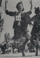
THE REEL OF TULLOCH—The Highland dancing was a popular feature of the sports at Farnham Park, Clon, yesterday. All the competitors were assisted by a good number of spectators.